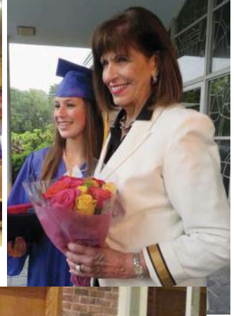
Our Lady's Academy 8th Grade Graduation - Tuesday, June 6