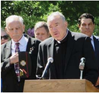
More photos from the Memorial Day Veterans Civic Service on Waltham Common on May 29, 2023.