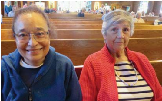
Photos from June 10/11 Weekend Masses