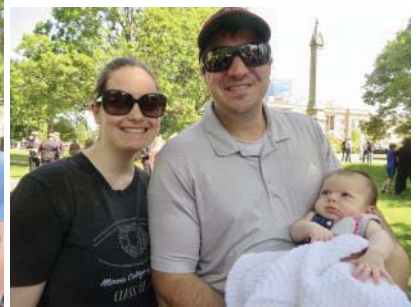
First Friday Mass for Our Lady's Academy June 2