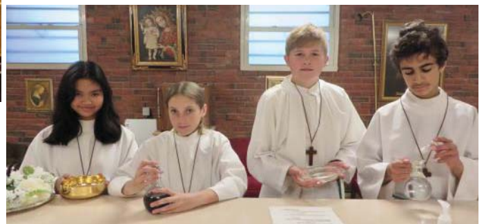
More photos of Ff. Campo's Naval Chaplaincy Service at US Naval Base in San Diego